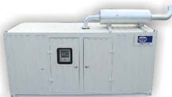
Range : 500 KVA to 2500 KVA